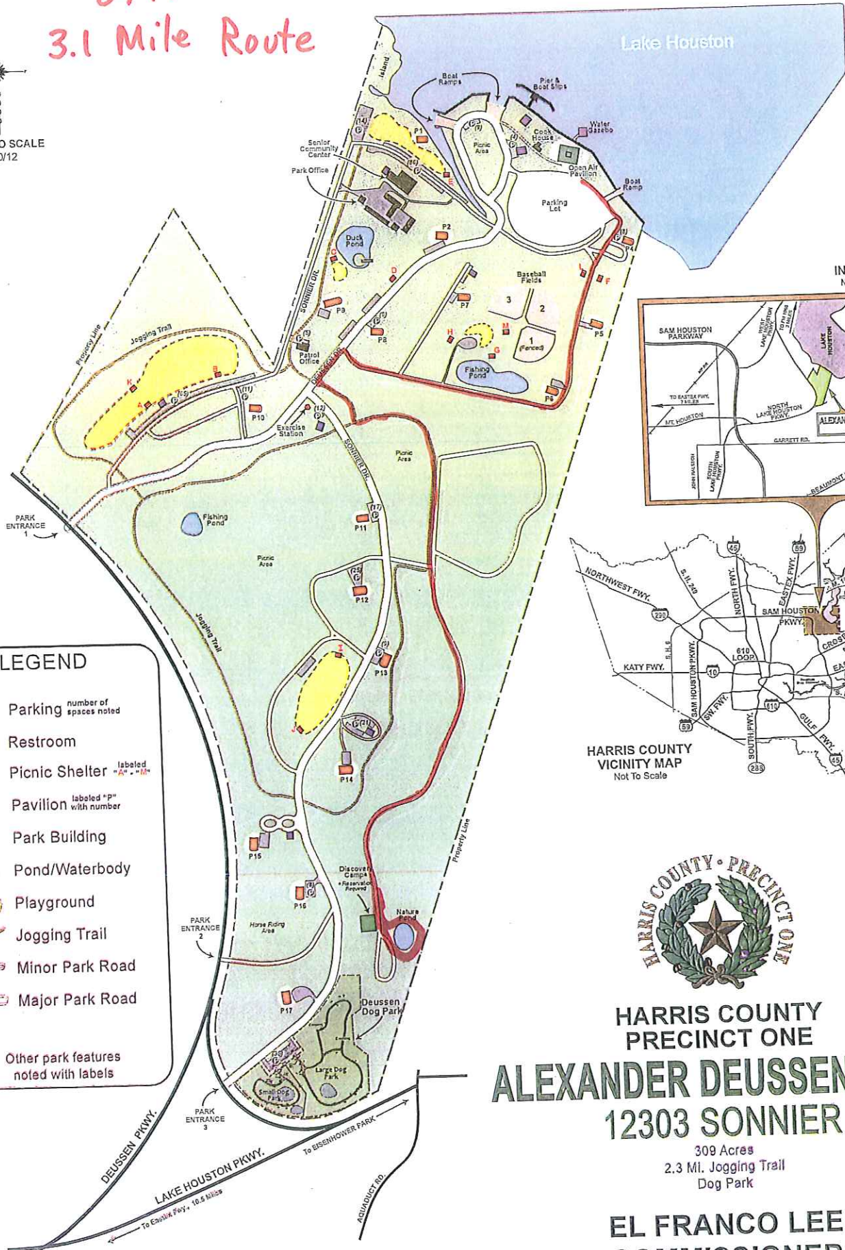
INSET MAP Not To Scale